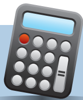
Figure out if you have enough disability insurance coverage by visiting www.lifehappens.org/disabilitycalculator .